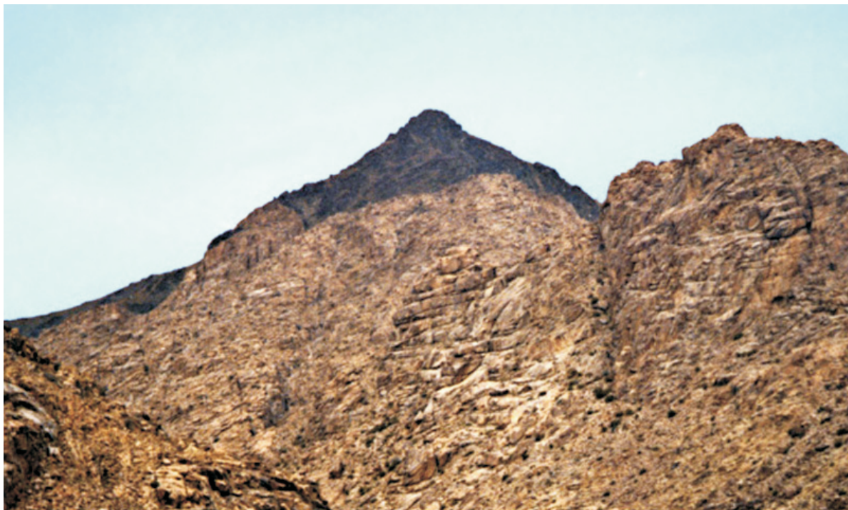
MOUNT SINAI - the mountain from which God spoke the 10 commandments in smoke and fire, is blackened and scorched