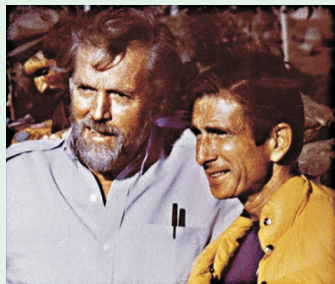
With Col. James Irwin - who also searched for Noah's Ark