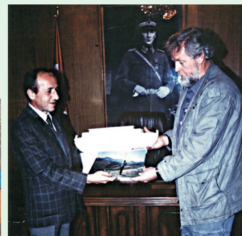
Noah's Ark Press Conference with Governor Sevkett Ekinci of the Agri district, Eastern Turkey