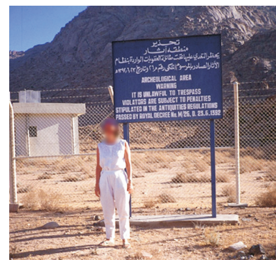
Mt Sinai - a protected archeological site

The mountain's peak has been blackened. Exodus 19:18 records "And mount Sinai was altogether on a smoke, because the LORD descended upon it in fire: and the smoke thereof ascended as the smoke of a furnace."