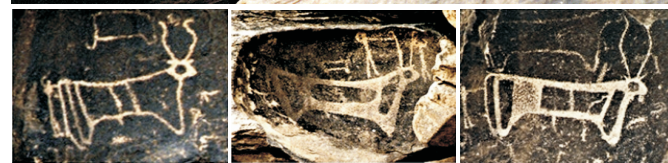
Apis Bulls - Egyptian cult worship in Saudi Arabia, as in Exodus 32