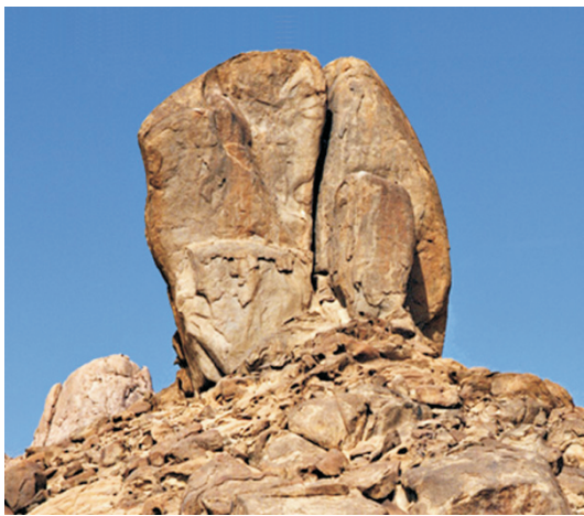
The Rock in Horeb - The close-up reveals the significant water erosion

T HE evidence of another Biblical miracle is still standing today!