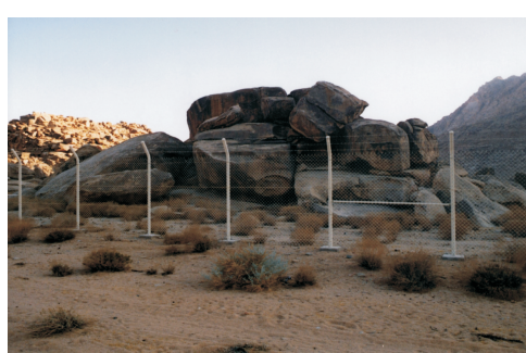
Protected - Now fenced off by the Authorities

A T the base of Jebel el Lawz is a large altar, with Egyptian Apis bulls, or calves, inscribed onto it.