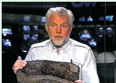
On CNN - Showing the laminated wood recovered from Noah's Ark