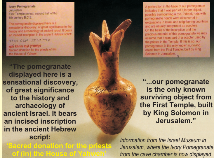
Ivory Pomegranate - recovered from the chamber and on public display