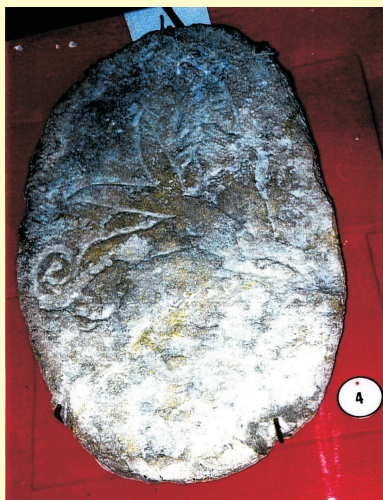
Carving found near tunnel entrance dating to the time of the invasion