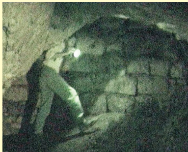
Tunnel entrance, through which the Ark was taken, is now walled up