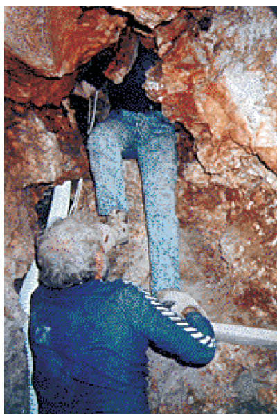
Tight squeeze - access was difficult

But while in Jerusalem in 1978, he had an extraordinary experience which led him to begin searching for it just north of the old city of Jerusalem. While walking near the "Skull face" of old Golgotha, he involuntarily pointed to a spot and spoke the words "That's Jeremiah's grotto, and the Ark of the Covenant is in there."