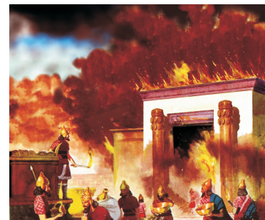
1st Temple was destroyed in 586BC

When the Temple was rebuilt in later years, the instructions for the rebuilding of the Temple fails to make any mention of the Ark being re-instated.