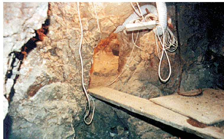
Cave System - Inside Mount Moriah, showing a portion of the excavation